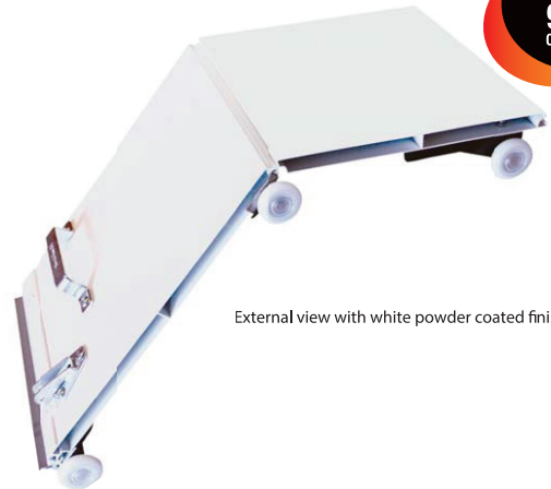
External view with white powder coated finish