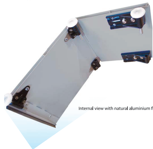
Internal view with natural aluminium finish